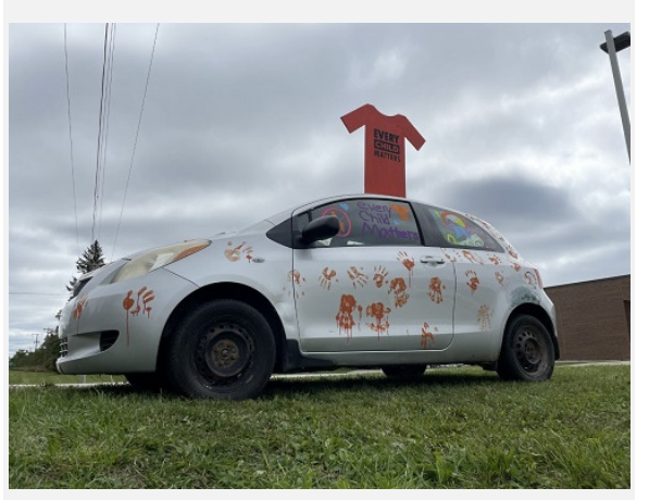
"Orange Shirt Car" designed by Grey Highlands Secondary School students and staff

On September 30, 2021, Canada observed the first ever National Day for Truth and Reconciliation, which coincided with the annual tradition of Orange Shirt Day. In Bluewater District School Board, flags were lowered at schools and work sites, while students and staff wore orange and participated in Truth and Reconciliation activities throughout the week. From collaborative whole school art projects and traditional ceremonies, to drama presentations and guest speakers, students were involved in many creative and thought provoking initiatives. Staff also engaged in various learning opportunities, including a live virtual presentation with educator and writer Dr. Niigaan Sinclair on how we can influence and empower through education, and be an ally. This occasion was just one opportunity to broaden our learning and understanding of the long-lasting damages of the residential school system on Indigenous Peoples and communities, and to honour victims, survivors, and others who have been impacted. View our web article.